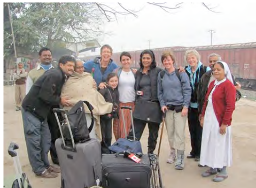
Last morning – catching the train to Delhi