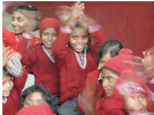
New uniforms are a big hit!

On the morning of first day, we inaugurated a new FreeSchool at Uttar Nagar, southwest of Delhi. A young pastor had offered his small church for a junior and senior class and his wife had become one of the two teachers. The other teacher is a young Muslim woman who had just given birth five days before. All the children are from very poor Muslim families and ISPCK was able to provide two sets of uniforms to the 50 children who were registered. The day after the uniforms were handed out, the enrollment rose to 80!