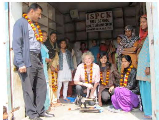
Launching the $50 Sewing Machine Campaign

While we have several fundraising strategies in the works, we launched the $50 Sewing Machine Campaign on our last visit. I discovered that the sit-down treadle sewing machine, that does all the fancy stitching costs $150, but the hand operated manual machines, ideal for learning, cost only $50. A teacher for a year costs $900. Since sewing and embroidery skills can make such a difference in a young girl's life and because I have the opportunity to speak to several groups this spring who are interested in girl's empowerment, I want to experiment with focusing on the practical benefits of the sewing machine in India. This "campaign" has the goal of establishing tailoring centres in 50% of our FreeSchools in India. We are hoping that we get good results by asking for donations to fund something concrete. We have revised our Sewing Circle brochure and it should be on the website by Monday. Please check it out.